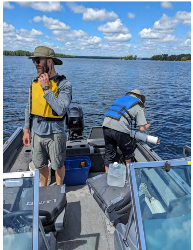
Water sampling. August 2023.