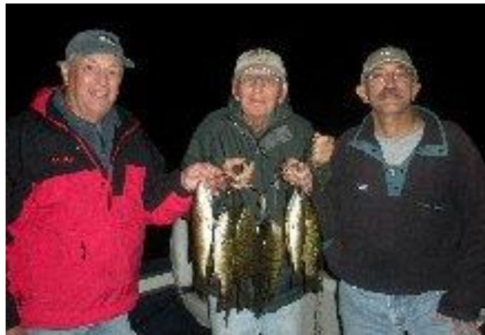
Figure 2. Jack Lake provides a diverse recreational fishery.

There have been several introductions (both authorized and unauthorized) of fish species to the Jack Lake fish community (Table 3).