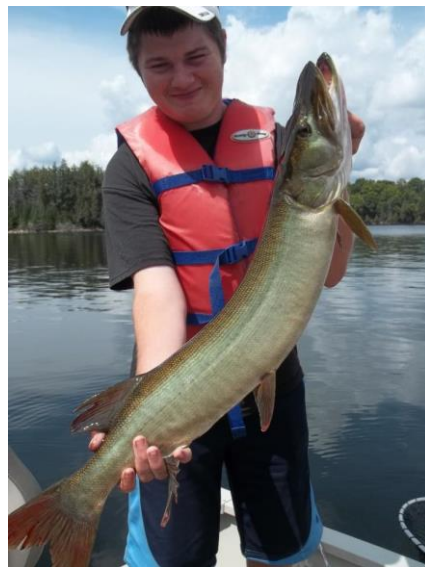
Figure 5. A typical Jack Lake muskellunge.

There is probably only a small targeted fishery for muskellunge on Jack Lake. Specialist anglers (i.e., MCI members) report harvesting (killing) only one fish over a 30 year period. It is likely that muskellunge are caught by non-specialist anglers while fishing for other species however this is difficult to quantify. Catch rates for muskellunge in Jack Lake generally meet or exceed the provincial standard indicating a relatively good quality fishery.