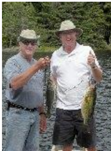
Figure 3. Creel survey programs are designed to ascertain what anglers are seeking as well as how successful they are.

A number of different types of creel survey have been used on Jack Lake (Table 5). A roving creel survey is one where a clerk travels around the lake to interview anglers in the act of fishing. The route is selected so that all potential angler locations are visible to and accessible by the roving clerk. A volunteer angler program is one in which cooperative anglers maintain records of their fishing activities over the season and then provide the information to the appropriate management agency for tabulation and analysis.