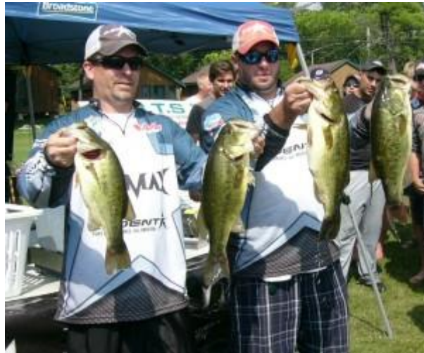
Figure 6. Winners of the 2012 Bancroft Bass Tournament Series (BBTS) event on Jack Lake.

ranged from 7.10-8.84 kg (Figure 6 and Table 16). The average weight of fish in the winning aggregate was 1.62 kg (3.6 pounds). The largest bass entered in this event weighed 3.11 kg (6.9 pounds).