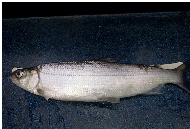
Figure 7. A lake herring angled in the spring of 2013 off Hurricane Point in Jack Lake.

In the past, most netting projects have not been directed to adequately sample the coldwater fish community of Jack Lake so there is little information on the status of the lake herring population.